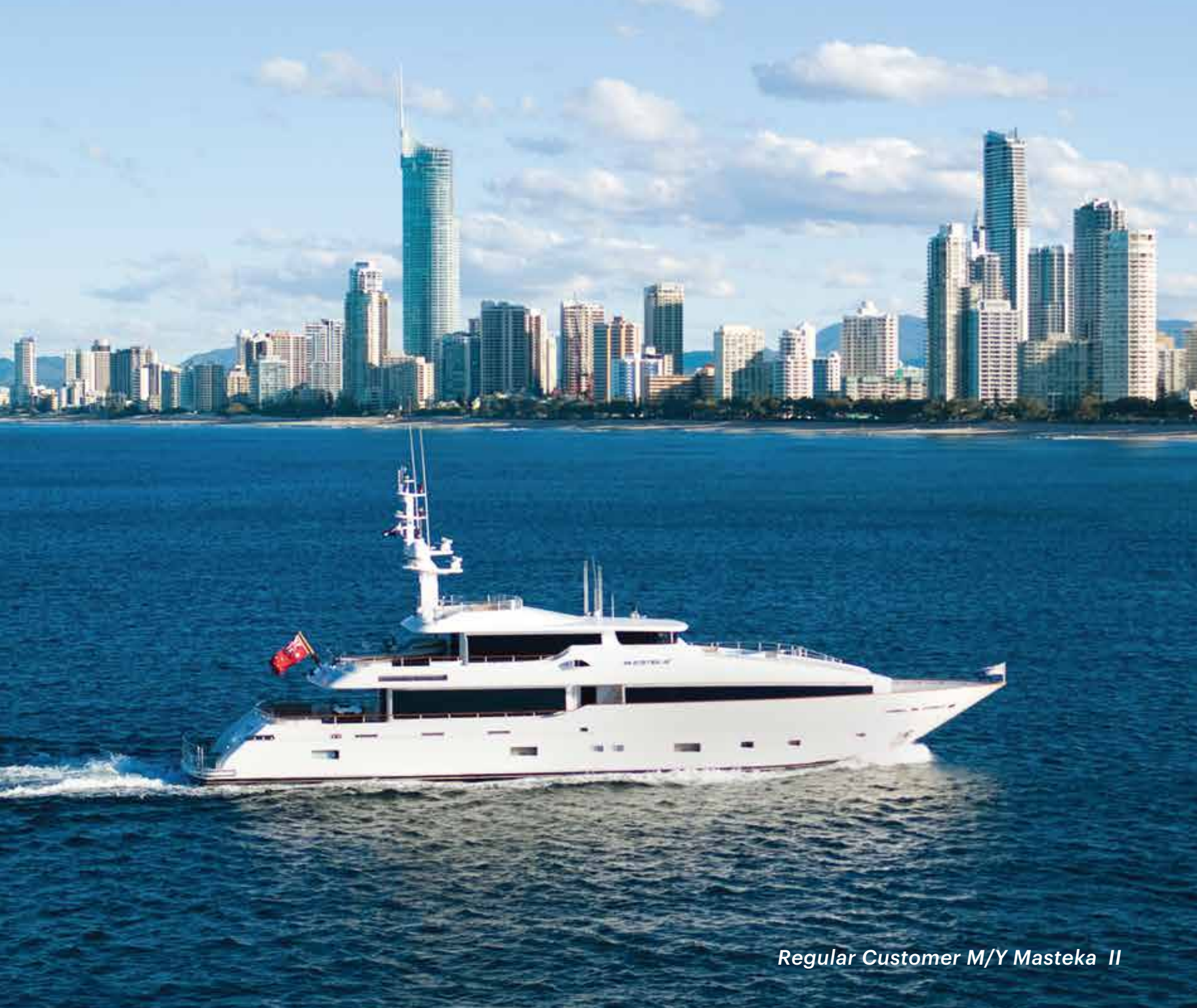
Regular Customer M/Y Masteka II