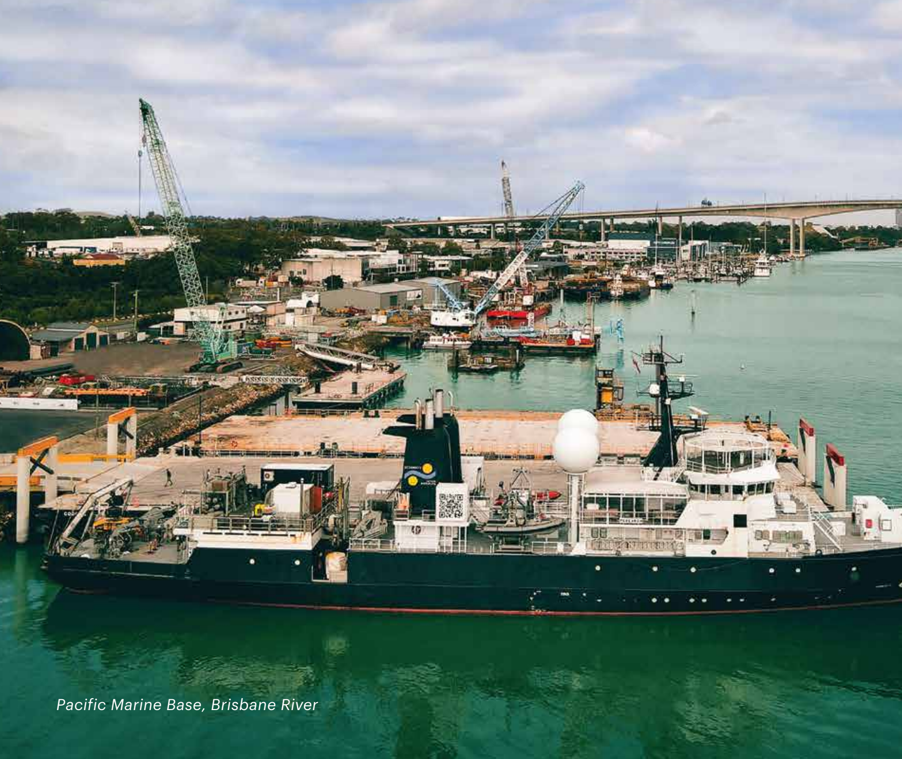
Pacific Marine Base, Brisbane River