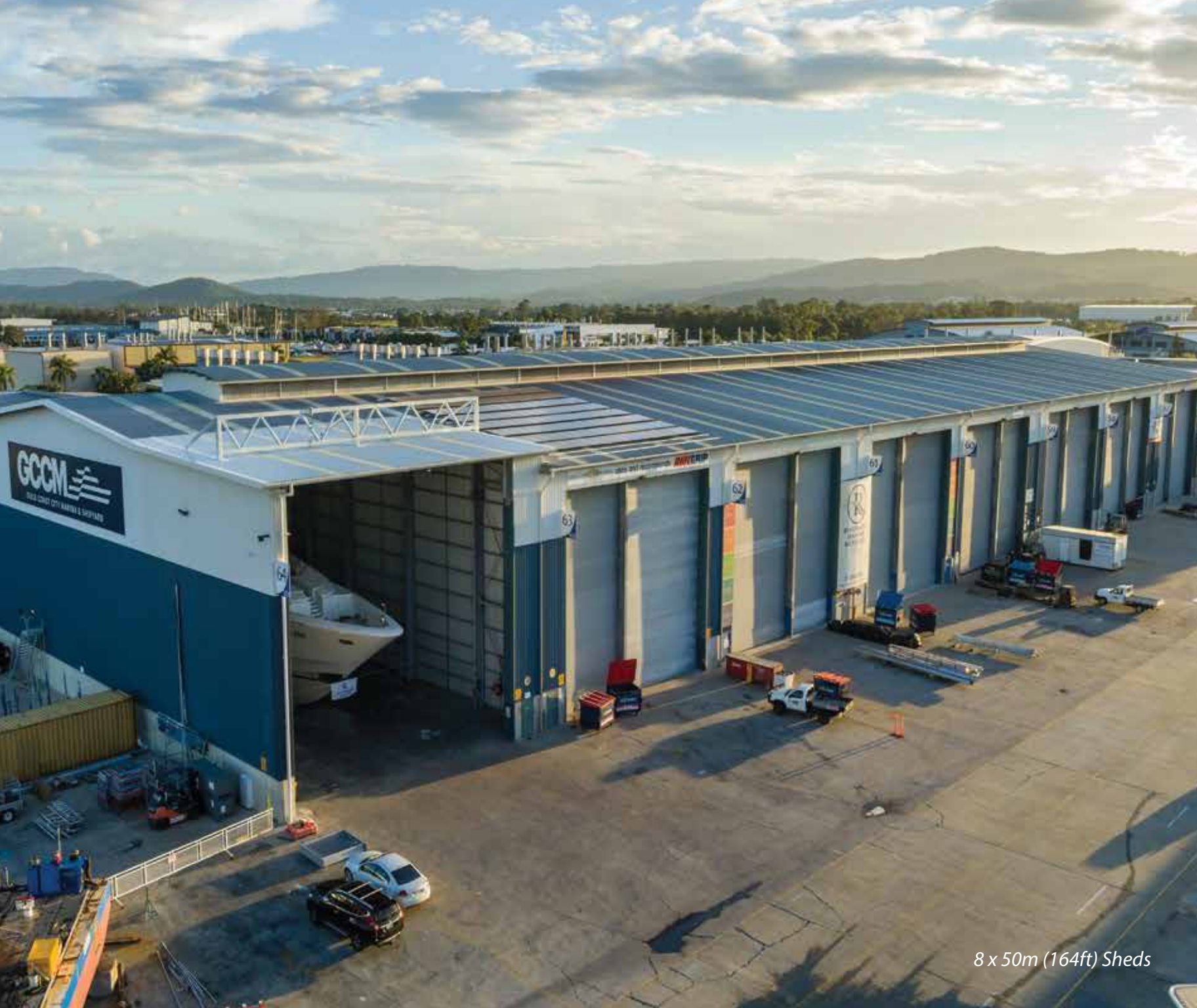
8 x 50m (164ft) Sheds